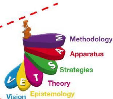
Levels of transdisciplinary knowledge of reality

Below is the six weeks final programme of the Committee UTC-Italia to the 3WTCv, created according to UTC Focus&Models. These are the result of research work, shared formation and Networking.